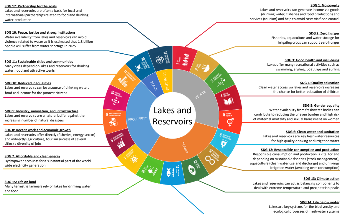
Figure 3. The summary of the contributions of lakes and reservoirs to support the achievement of the Sustainable Development Goals (SDGs).